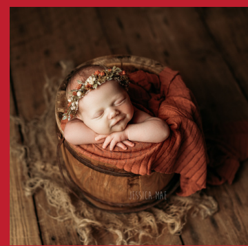
MASON & ASHLEY MCCCLINTOCK HATTIE SEPTEMBER 17